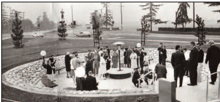
The sunken patio behind the Arcadia Chamber of Commerce is dedicated on November 13, 1965, as the Rotary Plaza in honor of the funding by the Rotary Club. Notice there is no Westfield mall yet in the background across the street. Let us know if you can identify any of the people in this photo taken by Milton Bell about a year after the Chamber office itself was dedicated.

• Proceeding with the 57/60 Confluence Project: Initial $35 million in local funding and $8.75 mil. in Metro funding for improvements to the dangerous and congested traffic flow that could be completed by 2016.