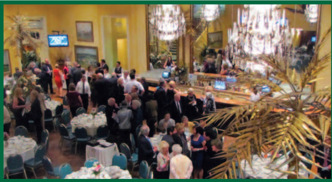
Elegant Installation Dinner setting at Chandelier Room at Santa Anita Park