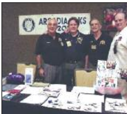
The Arcadia Elks lead a proud display...