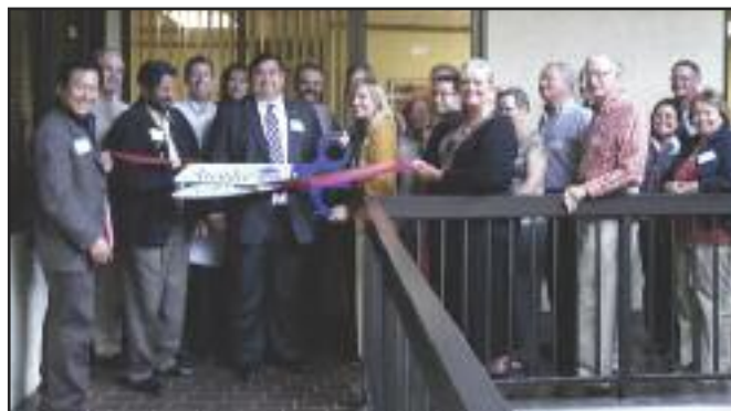
Accounting Annex grand opening