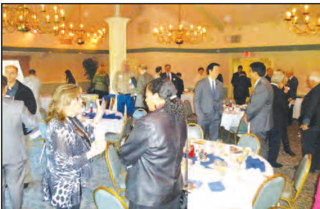
Attendees network before and after each breakfast.