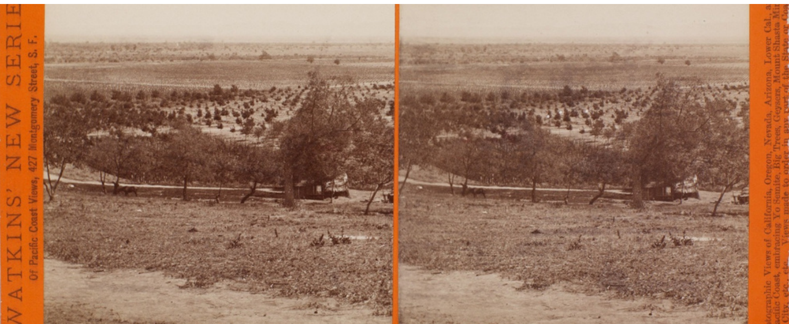
Stereograph image of Santa Anita Ranch in San Gabriel (now chiefly Arcadia, CA) by Carleton Watkins, approximately 1880, photoST Watkins (4446), Carleton E. Watkins Stereograph Collection. The Huntington Library, San Marino, California.