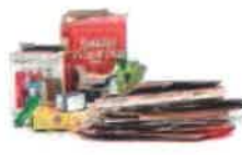
平整的硬纸板和纸板