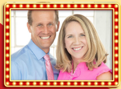
THE BERNS TEAM Corporate Partner of the Year